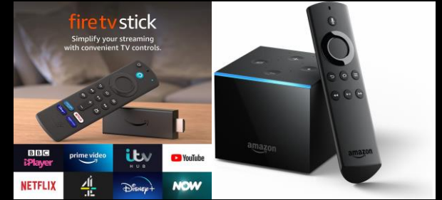
Amazon Fire stick or Box