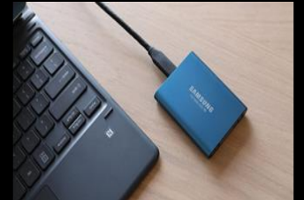
External SSD drive

Best Non Cloud Based system Is ThePhotoStick