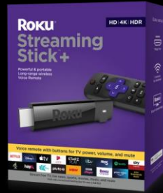
A Roku stick