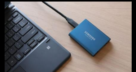
External SSD drive